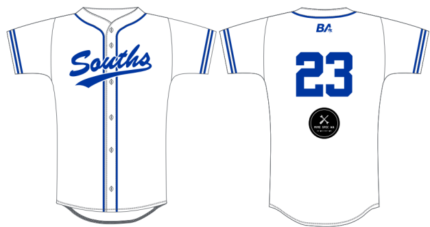
Away - Blue