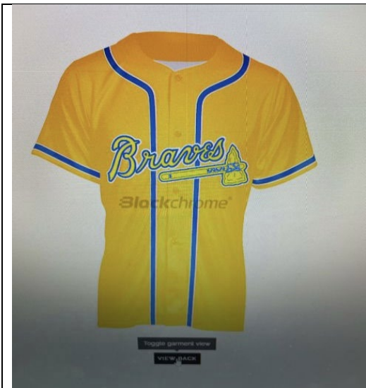
Carine Cats - Home